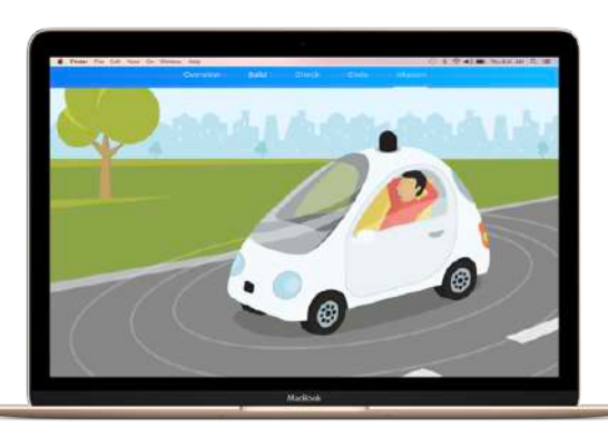
Self driving cars